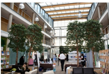
The West Atrium, National College, Nottingham