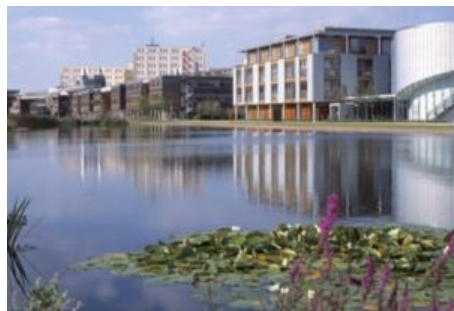
National College, Nottingham

A link has been sent to all delegates requesting their feedback via an online survey. We would like to thank all delegates in ad-